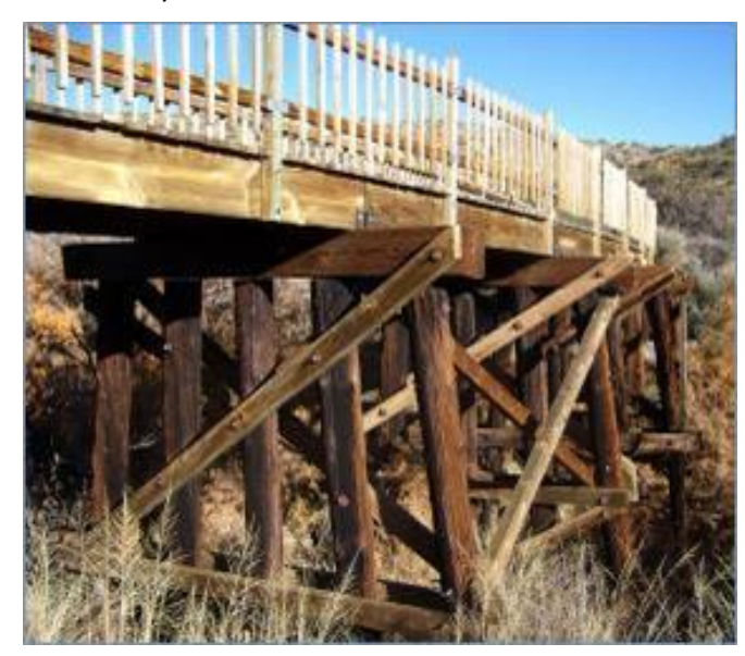
Figure 2 – The remnants of the Salado Canyon Trestle, restored and reinforced, now a hiking bridge

All three trails were originally the path of the Cloud-Climbing Railroad, which made its way up nearly 5,000' from Alamogordo to Cloudcroft from 1899-1947. Bridal Veil Falls was spot the train stopped for passengers to cool themselves in the mist of the waterfall pouring into Salado Canyon.