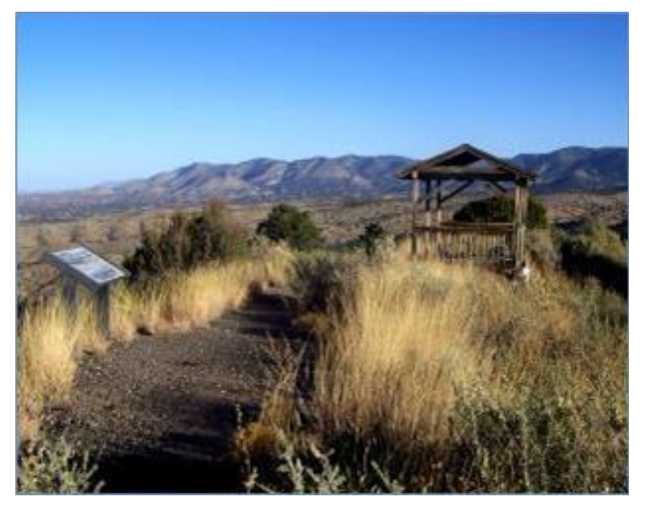
Figure 1 – Kiosk and spectacular view along the Grandview Trail

Located approximately 1 mile NW of the Village of High Rolls along FR162C, the Grandview (T130), Bridal Veil Falls (T129), and Salado Canyon Trestle (T128) Trails are part of the old Cloud-Climbing Railroad route.